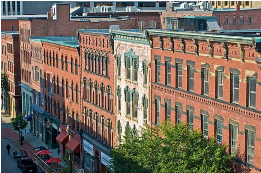
Historic Prince William street shopping district in downtown Saint John, 2009.

In 2010 Saint John won the designation of Cultural Capital of Canada and, with it, over half a million dollars in funding to promote the arts and culture. The Saint John poverty rate in the 2006 census had dropped sharply to 20.1 percent, and City officials and BCAPI believe that poverty continues to decrease as school mentoring, single mother support programs, and Saint John's higher education institutions expand. 18