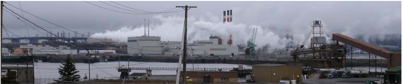
Industrial Saint John.

Saint John. Saint John is the oldest incorporated city in Canada. The Passamaquoddy and Maliseet Nations lived near the present-day site before the first European visit in 1604 by explorer Samuel de Champlain. The surrounding Bay of Fundy has the highest tides in the world, creating famous tourist attractions like the Reversing Falls. In colonial times Saint John became a bustling mercantile settlement where social life and economic activity revolved around a booming port that supplied much of Canada. A large influx of fleeing loyalists settled in Saint John after the American Revolution, including Benedict Arnold, and Saint John adopted as its motto, “The Loyalist City.” A catastrophic fire in 1877 destroyed much of the downtown, but a strong maritime economy helped rebuild it quickly 2 . In the 20 th century the city emerged as a hub of heavy industry that, especially after WWII, attracted blue-collar workers. At the same time, its gritty industrial reputation increased as municipal and industrial waste contaminated the waterways and harbor, and the smell of paper mills permeated all. 3