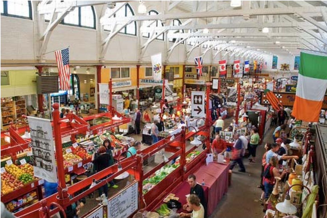
Saint John's City Market was built in 1876 drawing on the city's ship-building tradition, the roof is an inverted ship hull.