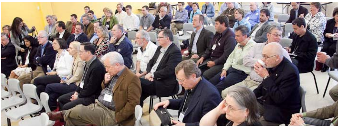
The second "Imagine the Possibilities" event in 2009.